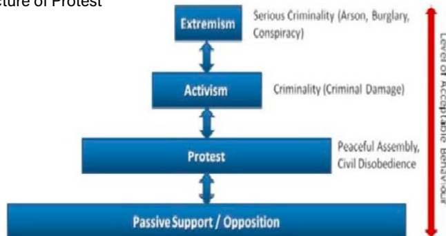
[Fig 1, 'The Structure of Protest', NPCC 2016]